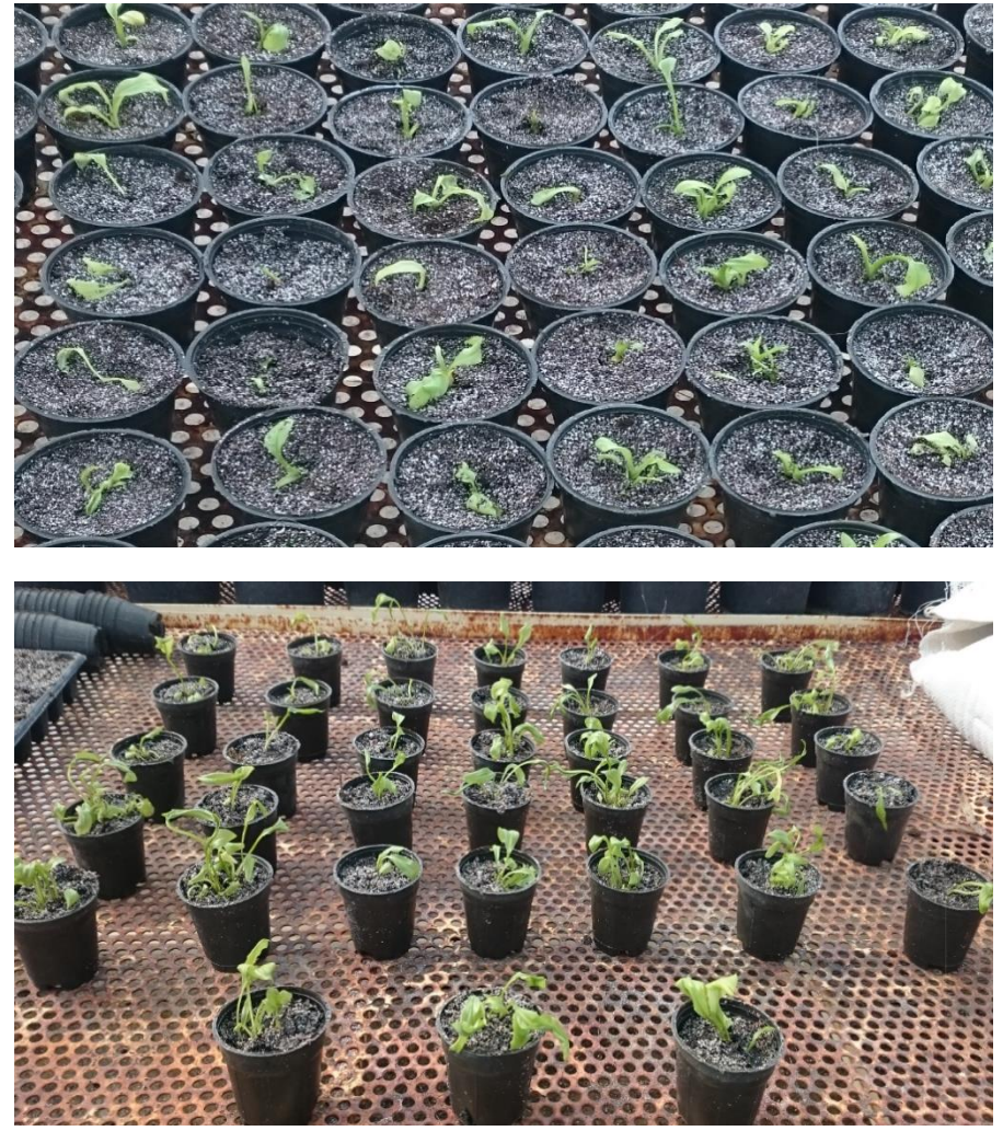
Fig. 2. Adaptation of in vitro rooted plants (Top) and tuberous plants (Bottom) of Calla lily in greenhouse condition

the plantlets have to recover themselves from these properties (Pospisilova et al., 1999). Because the greenhouse has considerably lower relative humidity, higher light levels and septic conditions that are hazardous to micropropagated plants compared to the in vitro environment (Janick 2007). In the present study, the rooted and tuberous plants were transferred to controlled conditions in the greenhouse, separately (Fig. 2). The infection to pathogens and disease was lower in tuberous plants than rooted plants in the greenhouse (less than 5%), following that the survival percentage of tuberous plants was higher than rooted plants after two weeks in the greenhouse (data not shown).