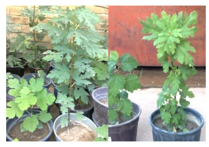
'Shah Anjir' 'Anjir Sabz' Fig. 2. In each photo: right seedling: palmate leaf; left seedling: lobate leaf.