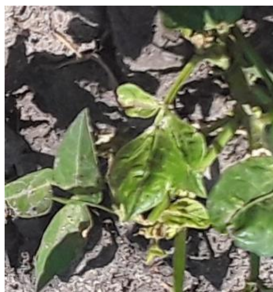
Fig. 2. Close-up photo of cowpea mosaic vein clearing symptom