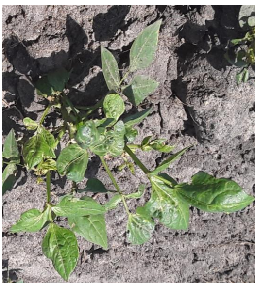
Fig. 1. Cowpea leaves with Mosaic symptoms

Host response for each treatment was recorded as shown in Table 2 based on the scale developed by Manaandhar et al. (2016).