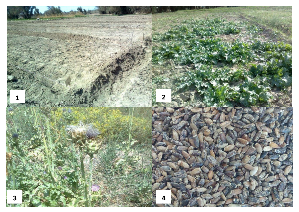
Fig. 1. From planting to harvesting of milk thistle: 1) Land preparation, 2) Initial plant growth, 3) Flowering and seed maturation, 4) Harvested seeds