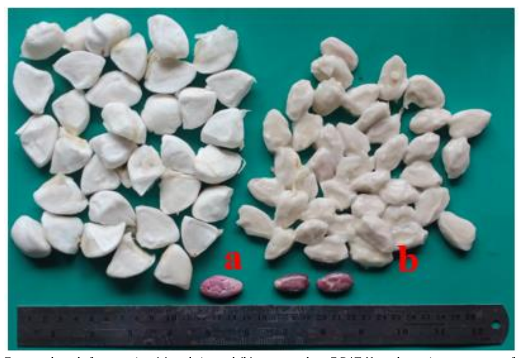
Fig. 4. Extracted seeds from unripe (a) and ripened (b) cacao pods at 7 DAT. Note the moisture content of cacao pulp from ripened cacao pods.

Cacao pulp contains 82-87% water and 10-15% sugars (Afoakwa, 2016). Sugars are broken down into simpler forms during respiration, producing CO_2 , water, and energy. Regardless of the ethephon concentrations applied, this breakdown causes a rise in the moisture content of the pulp and softening of the ripened cacao pods. Our findings on this parameter, however, differed from what has been reported by Laylah et al. (2023) on the Sulawesi 2 (S2) cocoa clone, implying that there is a varietal variability in cacao postharvest ripening.