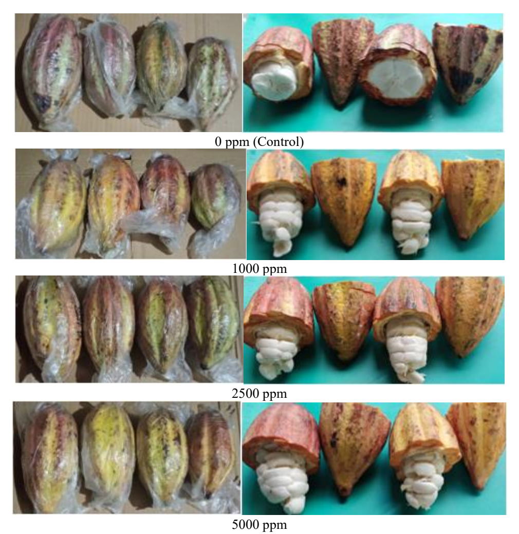
Fig. 3. Pod ripening (left photos) and pulp appearances (right photos) of cacao in response to varying ethephon treatments at 7 DAT.